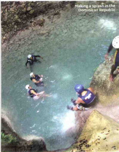
Making a splash in the Dominican Republic

There's nothing wrong with soaking up the sun on a tropical honeymoon. But if you've been there, swum that, one of these thrill-seeking options may be just the thing to add a little splash to your trip. TEXT BY KIMBERLY GOAD