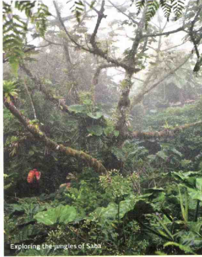
Exploring the jungles of Saba